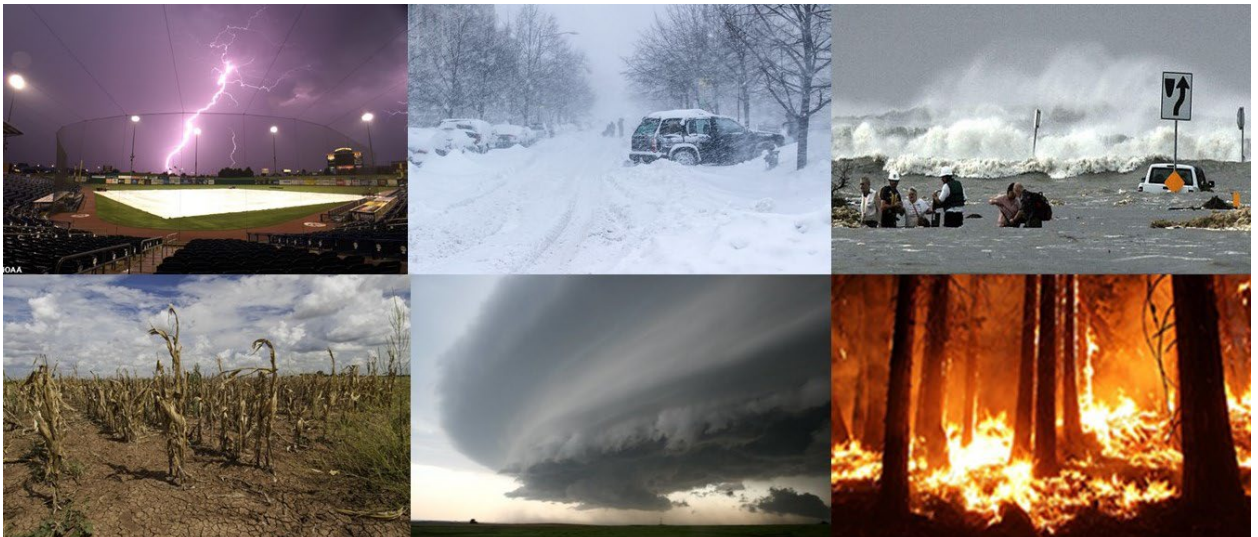
Figure 2: Images of High Impact Weather. Moving clockwise starting in upper left: 1) Lightning strikes Citibank Ballpark in Midland, Texas. Credit: Brian Curran, NWS. 2) "Snowzilla" that hit Northeastern US in January 2016. Credit: Joe Flood. 3) Hurricane Ike storm surge in September 2008. Credit: NOAA. 4) Drought in Texas in August 2013. Credit: Bob Nichols, USDA. 5) Supercell thunderstorm in Oklahoma in June 2008. Credit: Sean Waugh, NOAA/NSSL. 6) Wildfire. Credit: NOAA.