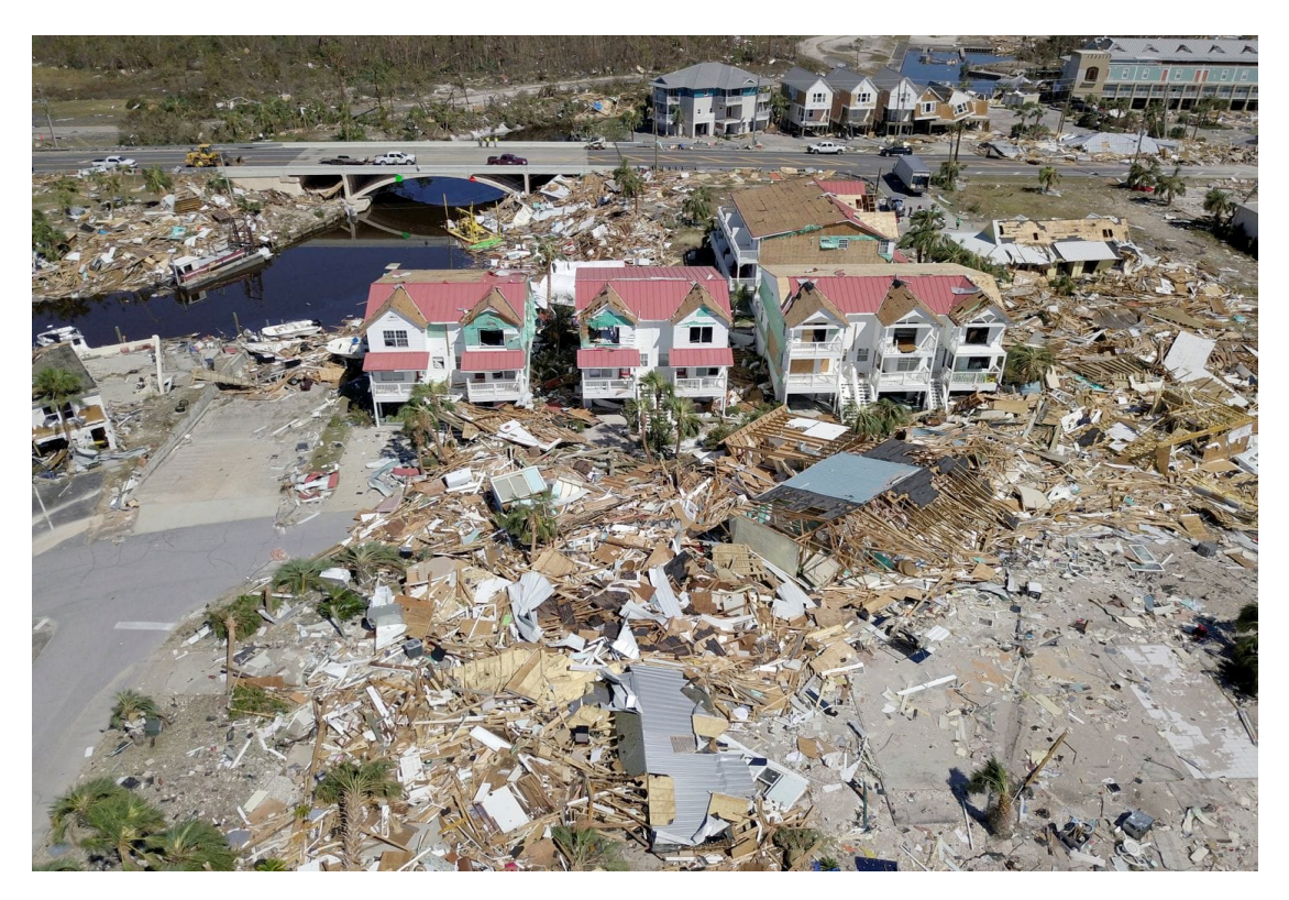
Figure 3: Mexico Beach, FL after Hurricane Michael (2018). Older homes not built to code are completely destroyed. But newer homes built to code suffered relatively minor damage.

Not only do building codes mitigate losses, but can also make insurance more affordable thereby closing the so-called protection gap. Better understanding of the range of future extreme weather events is critically needed to gauge the effectiveness of current codes, analyze the effects of policy decisions, and inform retrofitting our nation for the future.