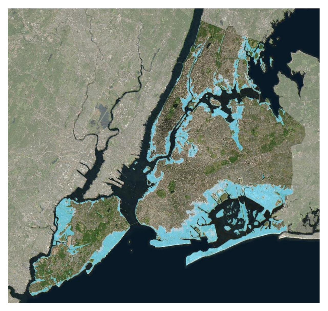
Exhibit 3. Anticipated 100 year (1% or greater annual chance of flooding) flood map of New York City in 2050.<sup>24</sup>