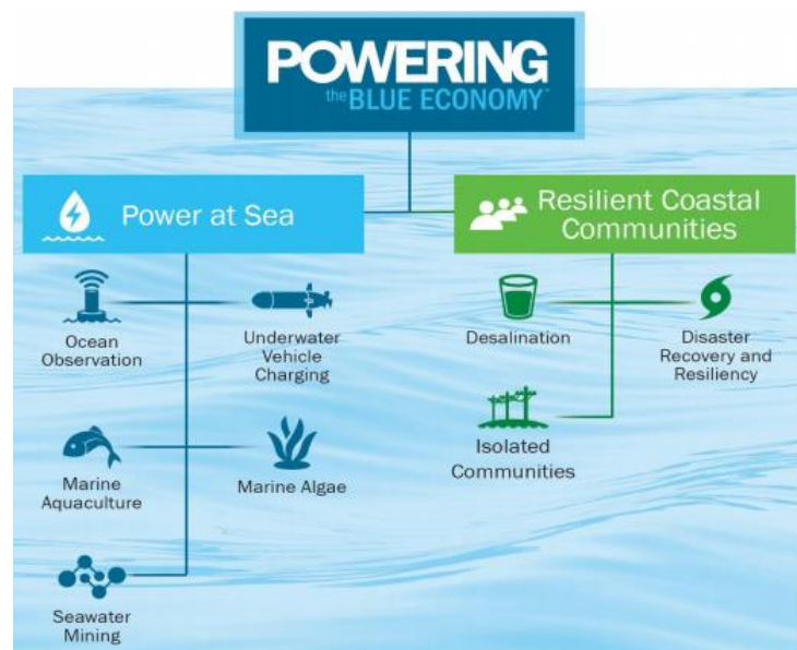
Figure 2: Powering the Blue Economy Sectors (WPTO)

Through extensive consultation within the U.S. marine energy and maritime sectors, the U.S. Department of Energy’s Water Power Technologies Office (WPTO) recently released its ‘ Powering the Blue Economy ’ initiative; which details specific, near-term market opportunities for marine energy. These include powering oceanographic measurement devices, recharging Underwater Autonomous Vehicles (UAV), renewably powering offshore aquaculture facilities, desalinating water, and powering remote isolated communities, amongst others (see Figure 2).