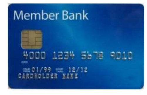
Figure 1: EMV chip card

EMV chip payment cards are based on widely used and highly secure smart card technology, also referred to as "smart chip" technology. Smart cards – which can look like a card but can also take on different forms – have embedded integrated circuit chips, powerful minicomputers that can be programmed for different applications. Through the chip, the smart card can store and access data and applications securely, and exchange data securely with readers and other systems. Smart cards are ideal for many applications, especially payments, because they provide high levels of security and privacy protection, are easily