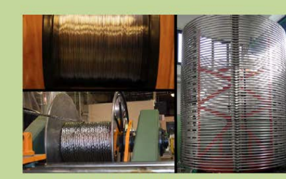
US completed Toroidal Field Coil Conductor deliveries and acceptance in 2017.